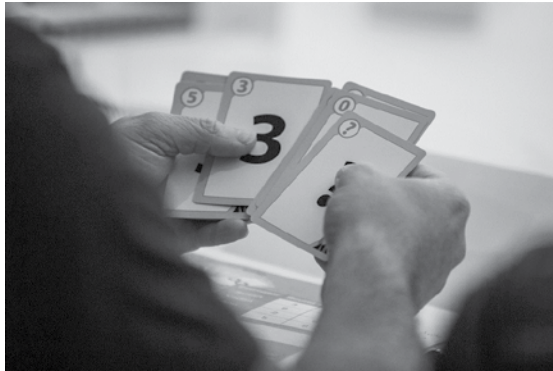
FIGURE 2 Software developer privately estimating a user story (Mountain Goat software, 2014)